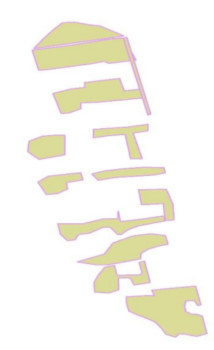
Figure 2: CHERP LANDSCAPING AREAS

All the other Instructions remains the same.